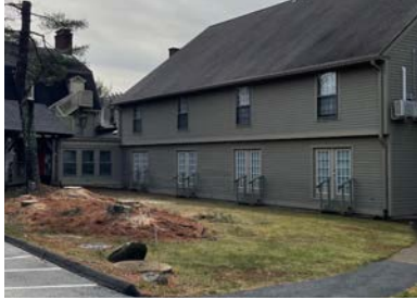
Before the stump removal and regrading