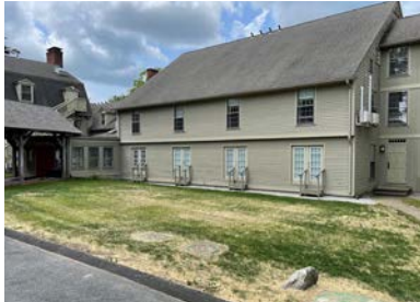
After, almost grown-in.