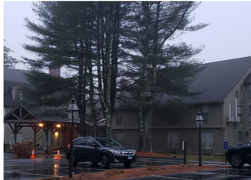
Left: The pine trees, ca. 1983, questionably planted as privacy bushes. Right: Why you don't use pine trees as privacy bushes, ca. 2023.

But the truth is their majesty was tipping into the despotic. Tree roots crept under Guest House's foundation and threatened to buckle up under it. Some penetrated underground pipe and conduit systems, causing difficulties with evacuating water and waste. And they had grown to such a height that we feared a strong wind or snowstorm might topple them onto the building and cause major damage.