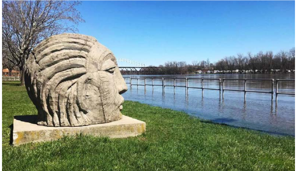
At Harbor Park in Middletown, Connecticut, a large stone sculpture of a stylized man's head serves as a tribute and remembrance of the Wangunk's history in the region.

Villages: Cockaponset, Coginchaug, Cossonacock, Hockanum, Machamoodus, Mattabesec, Momacok, Naubuc, Pocowset, Pyquag, and Suckiog